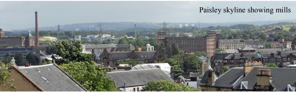
Paisley skyline showing mills

The Hotel is some 5 miles from Paisley town centre, and has been chosen to allow us to: