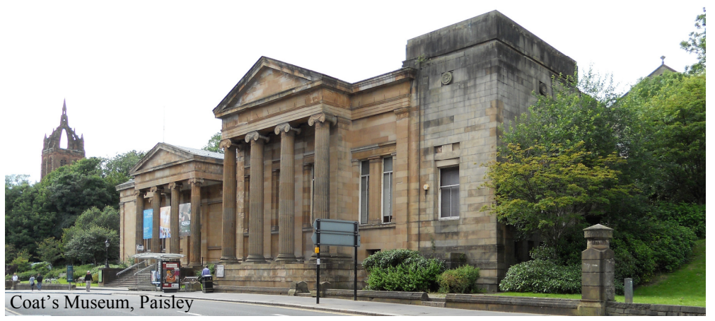
Coat's Museum, Paisley